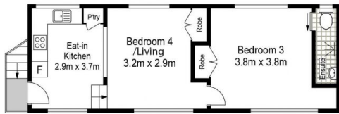
UPPER LEVEL (SEPARATE ACCOMMODATION)