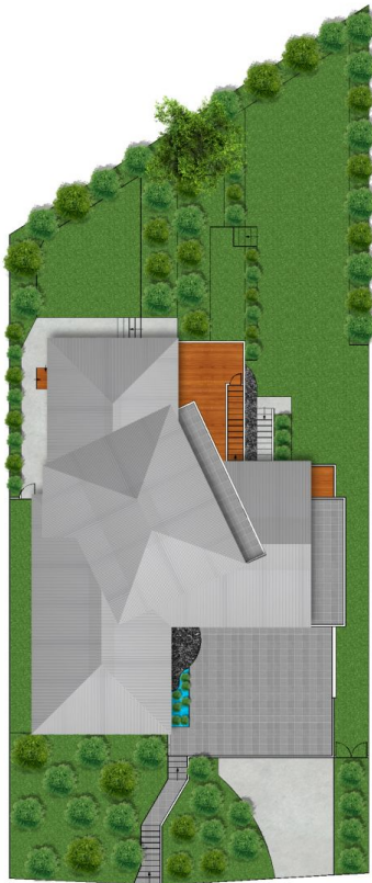
Site Plan (Scale Approximate)