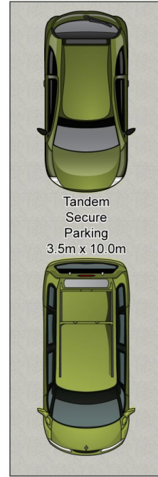
( Not In Position )