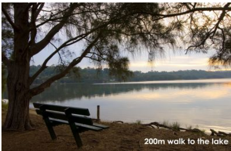
200m walk to the lake