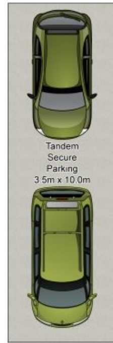
( Not In Position )