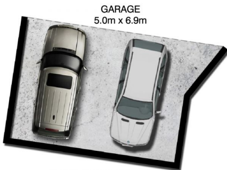
AT THE FRONT