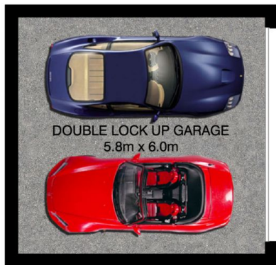
(NOT ACTUAL LOCATION)