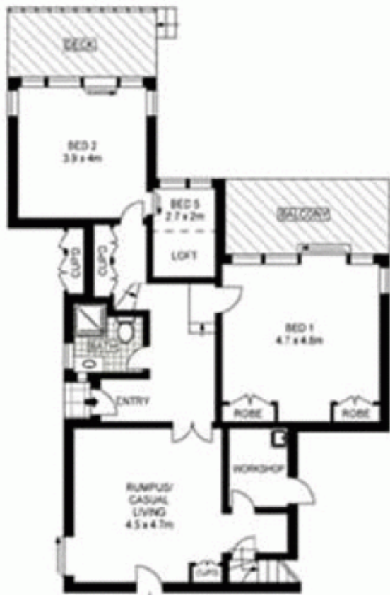
ACCESS TO UNDER HOUSE STORAGE GROUND LEVEL