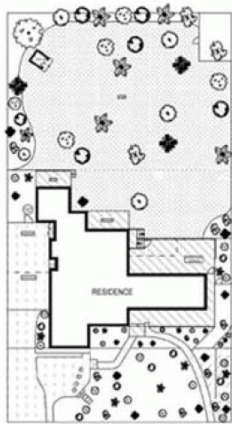
SITE PLAN ( NOT TO SCALE )