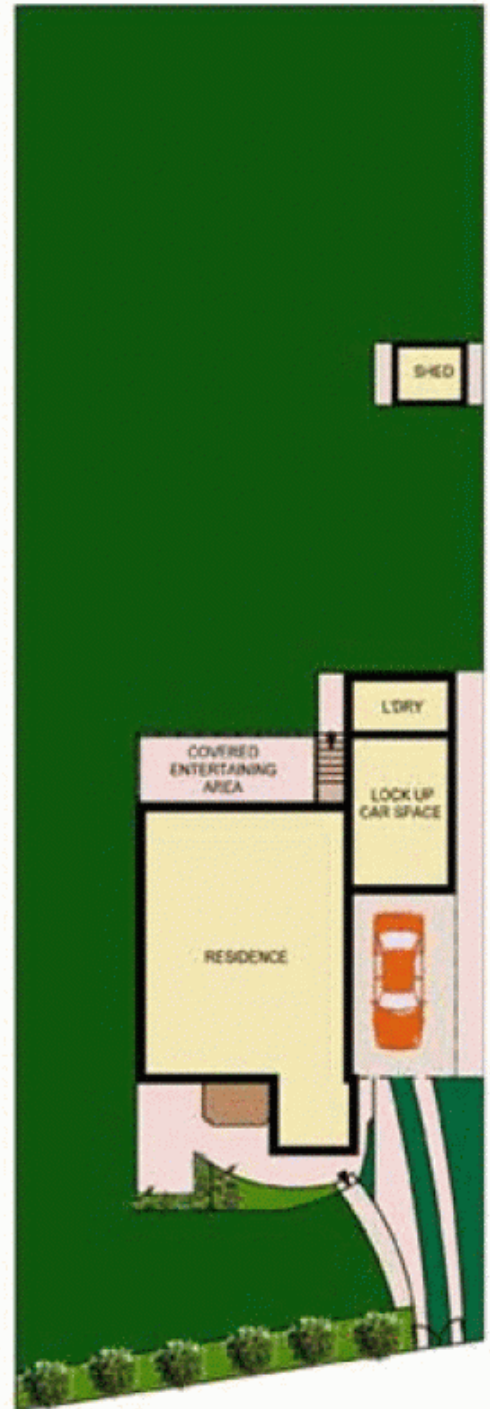
SITE PLAN ( NOT TO SCALE )