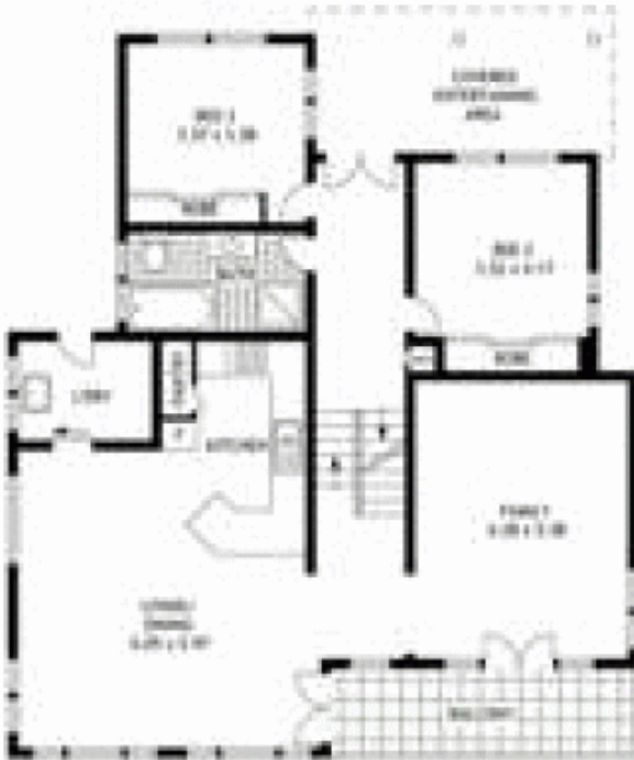
FIRST GROUND FLOOR