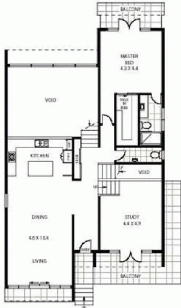
UPPER LEVEL (ENTRY LEVEL)